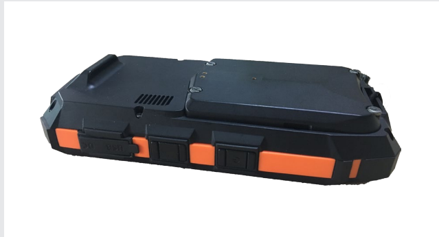
Version with Extended Battery**