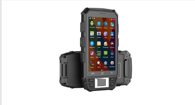
Version with optional Fingerprint Reader