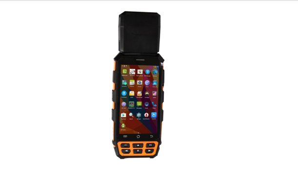
Version with Extended LF-Antenna**