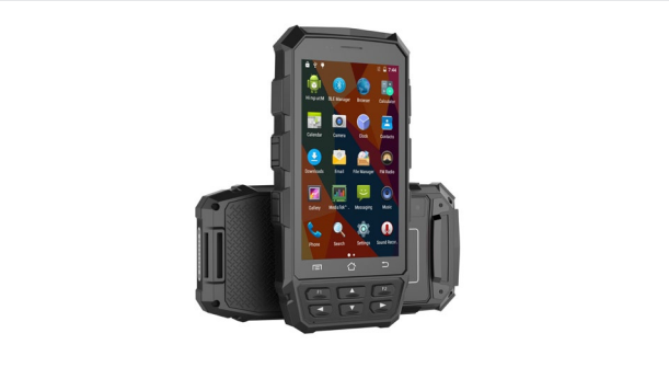
Version with Keypad